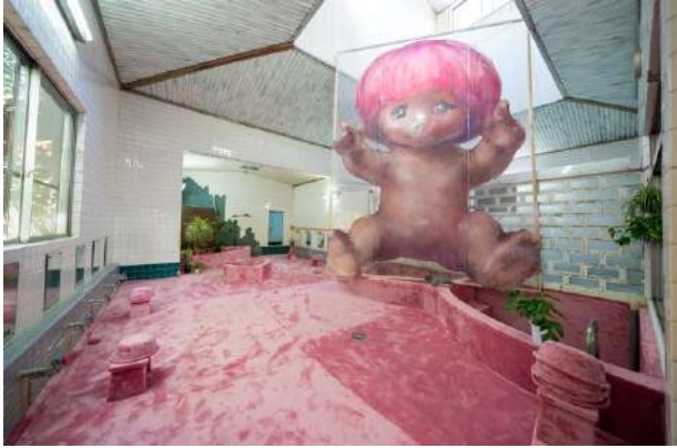
Makoto Egashira - Happy together in the bath