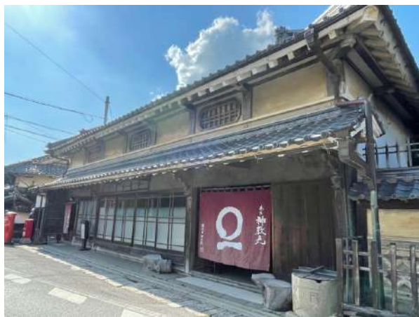
Arikawa Pharmacy (Toriimoto)