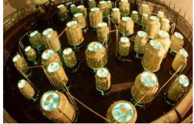
Taira Ishikawa - Cooling Towers